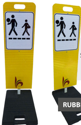
PORTABLE CROSSWALK SIGN

REPÈRES VISUELS SPÉCIALEMENT CONÇUS POUR BRIGADIER SCOLAIRE