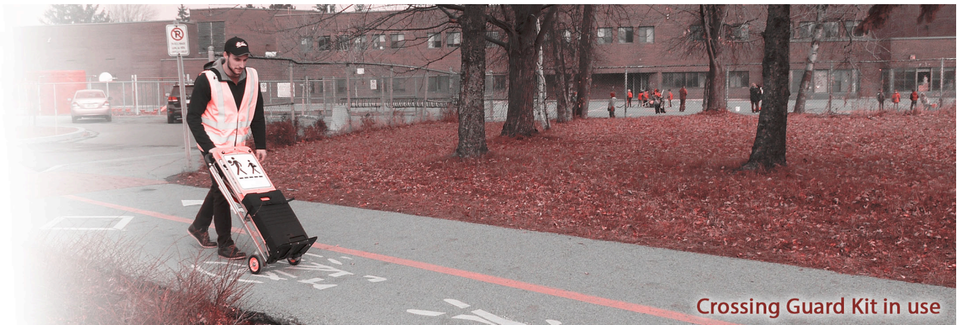
Crossing Guard Kit in use